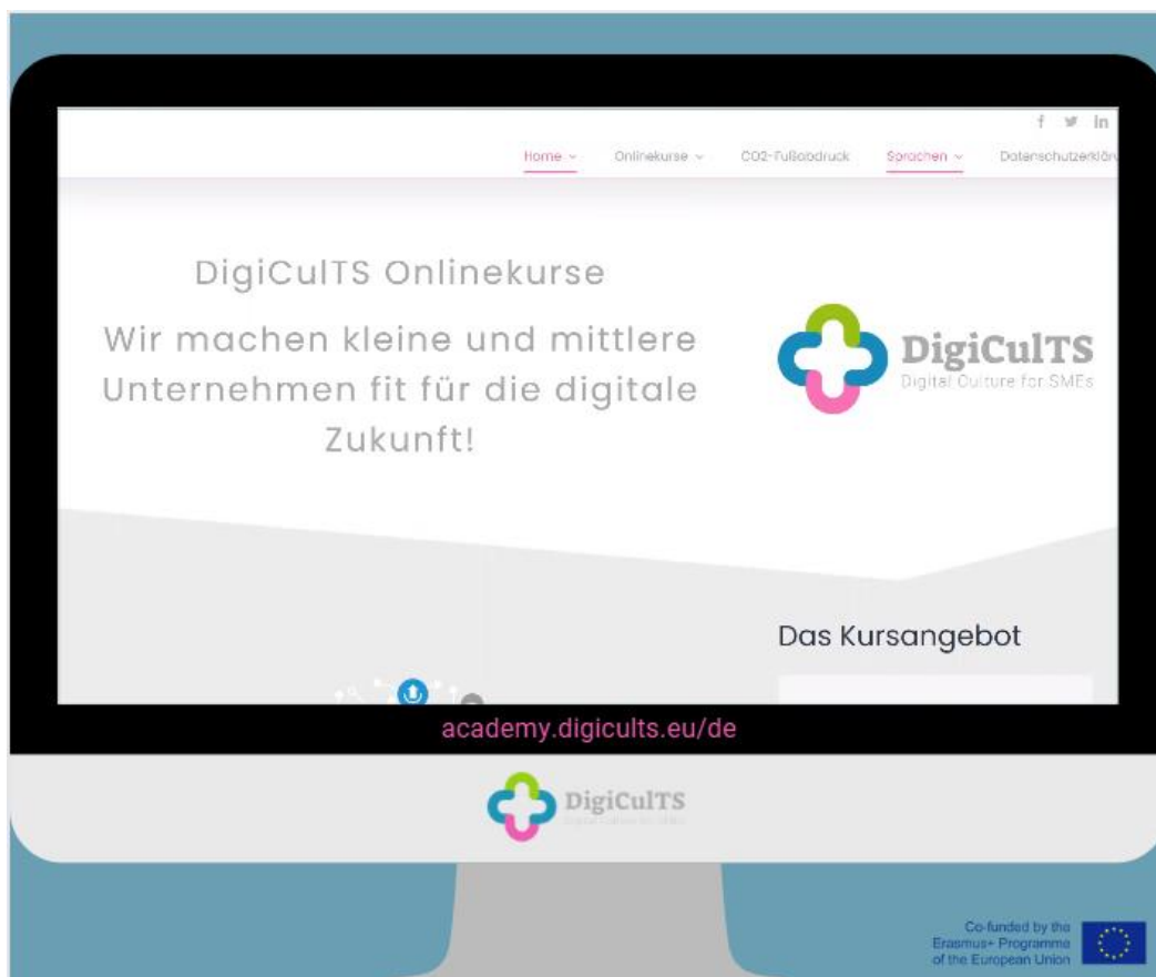
Figure 2: Check out our promo video on our learning platform online.

Why choosing to learn with DigiCulTS? Our courses are based on research, contain plenty of practical examples from various small and medium-sized enterprises from all-over Europe. No registration is necessary, and you can access and complete the courses at your own pace .